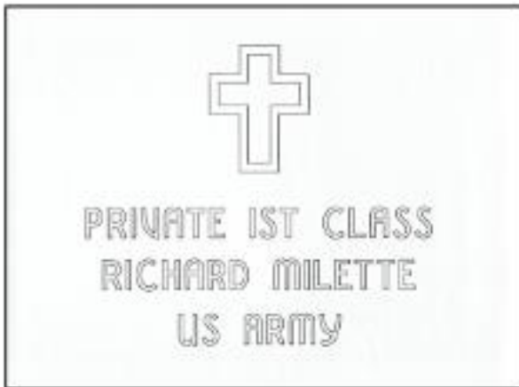
SAMPLE PAVER WITH EMBLEM AND 3 LINES OF LETTERING

Pavers can be purchased to honor any Veteran in Veteran's Garden at The Town of Westerlo Veterans Memorial Park.